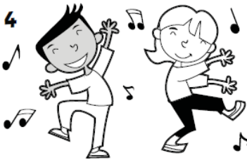
ride a bike / dance