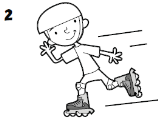
rollerblade / dance