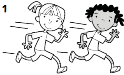
jump / run